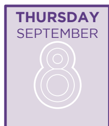
Table Selection Reception Exclusive for Table Sponsors